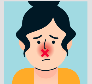
Loss of smell

The Infectious Diseases Act requires a person who has reason to suspect that he is a case or carrier of COVID-19, or has had contact with a person with COVID-19, to act in a responsible manner to not expose other persons to the risk of infection by the disease.