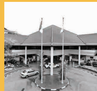
Present: Institute of Mental Health

This programme has its origins in the work done in the aforementioned Early Psychosis Intervention Programme, and subsequently with a number of commissioned studies from external service providers and policy makers including those from various Ministries. These include qualitative studies and large-scale population-based studies like the landmark Singapore Mental Health Study (which has also developed a culturally valid instrument to measure the level of positive mental health in our local population) and the Well-being of the Singapore Elderly (WISE) study. Our Research Division is not