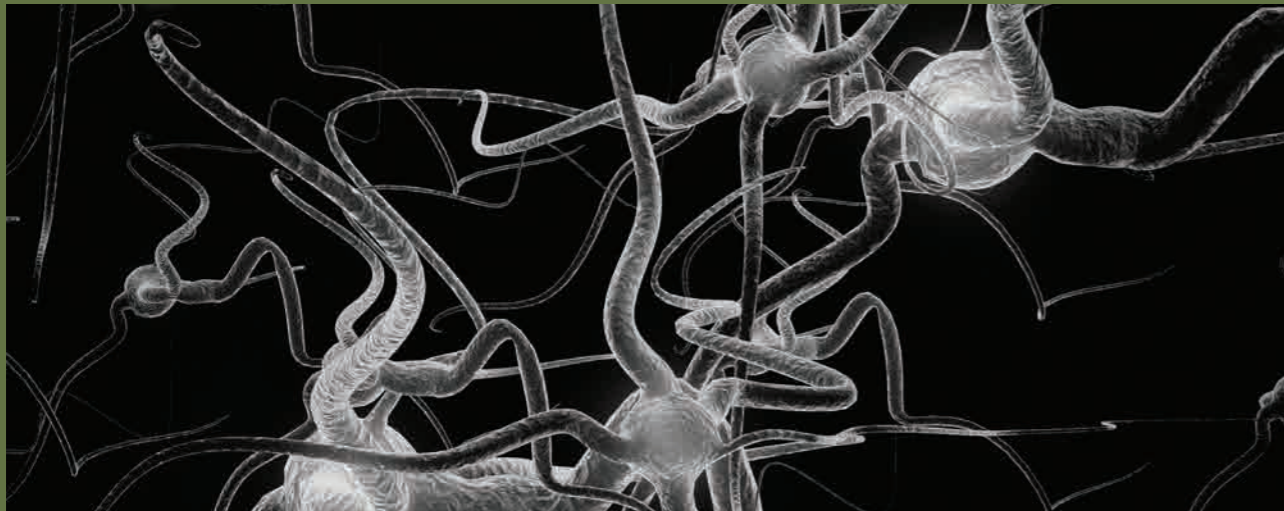
Neuron active nerve cell in human neural system