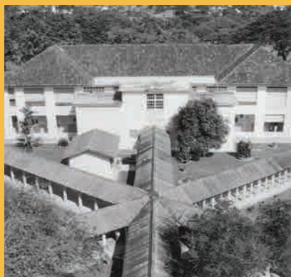
Past: Humble beginnings of Woodbridge Hospital

the only part of IMH that engages in research though. The Department of Nursing Administration embarked on its own research journey in 1999. This was further enhanced with the introduction of evidence-based practice in 2008. Our nurse-researchers have won a string of Research Grants and have gone on to forge international partnerships that have contributed to