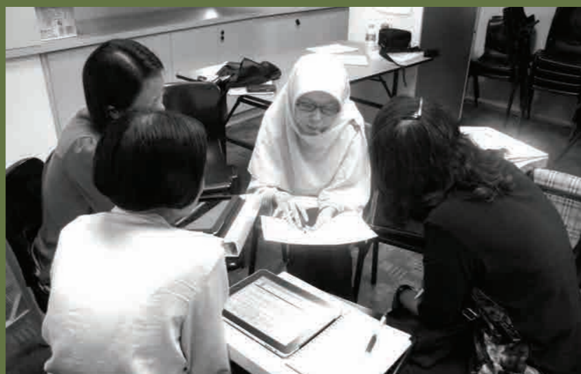
Mental health literacy interviewers' training

We are glad that we have created a culture for research where none existed before. A sense of the importance and relevance of research has penetrated the awareness of everyone in the Institute. This is evident in the number of people engaged in research, the exponential growth in the number of research projects and papers published, the high ethical standards that we have upheld, and the various mechanisms that are now in place to facilitate research.