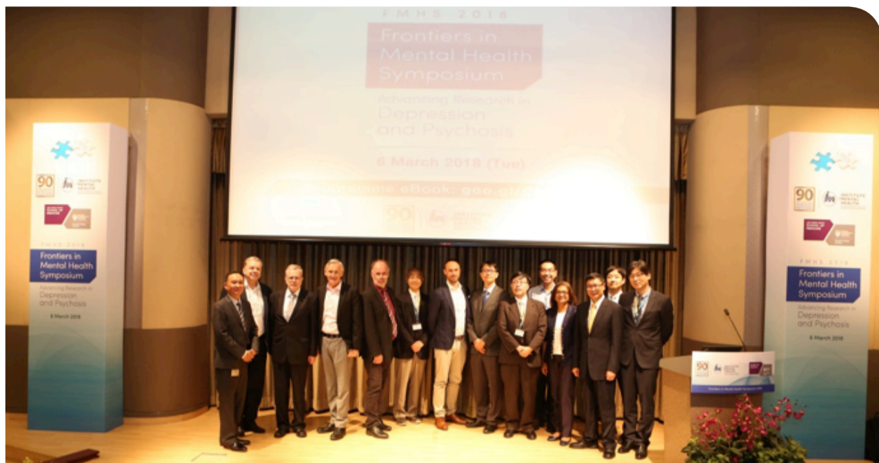
Speakers and Organisers for the Frontiers in Mental Health Symposium at Institute of Mental Health.